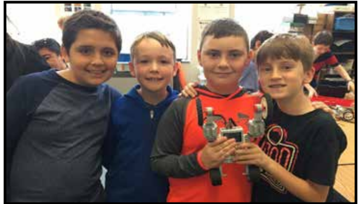
Students at the Snowball Stride 5K Run/Walk (above) and the Lego Robotics class.

Next AFCA Meeting: April 19, 7 p.m. at Barrett School