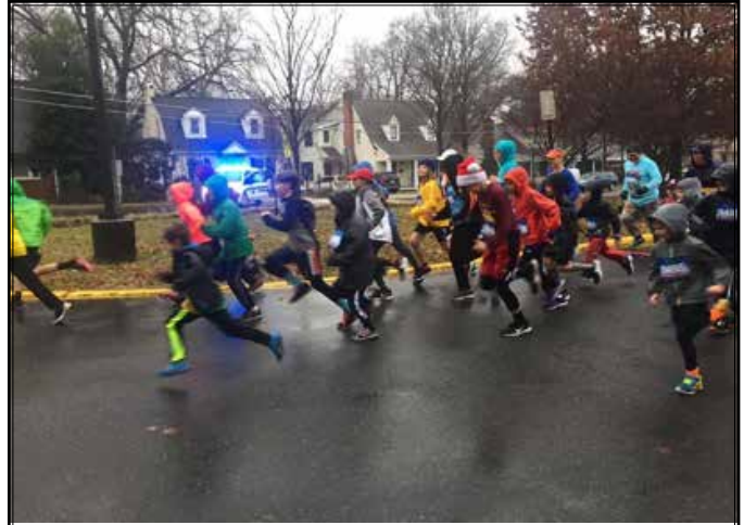
PHOTO: Runners take on the Snowball Stride 5K

Thank you also to all who braved the rain for the Snowball Stride 5K on December 15 th . We loved running with our staff, students, and neighbors.