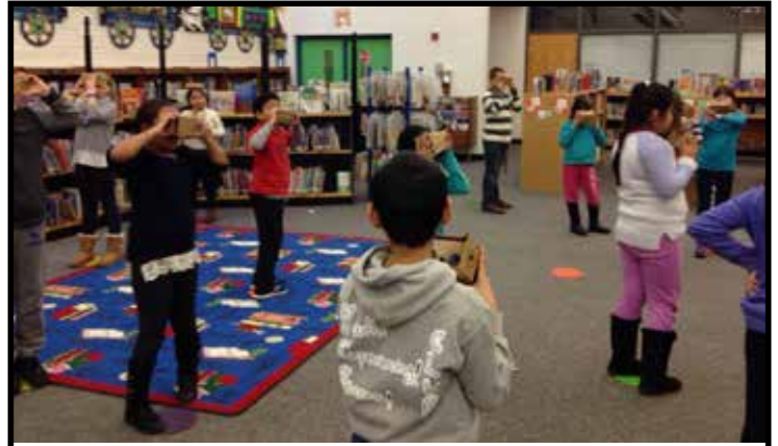
"Whale shark!" Students use new google cardboard viewers to try virtual reality in the library at KW Barrett Elementary.

Kenmore Play: The Kenmore Middle School Act II Theater program is proud to present "The Lion King, Jr," featuring many of your Arlington Forest friends and neighbors. The performances are Thursday and Friday, January 21 and 22 at 7 pm at Kenmore. No tickets are required, but donations are encouraged and accepted, with the proceeds benefiting the Theater Department to help defray the cost of this and future productions. Your whole family will enjoy this wonderful Kenmore production. Come see "The Lion King"!