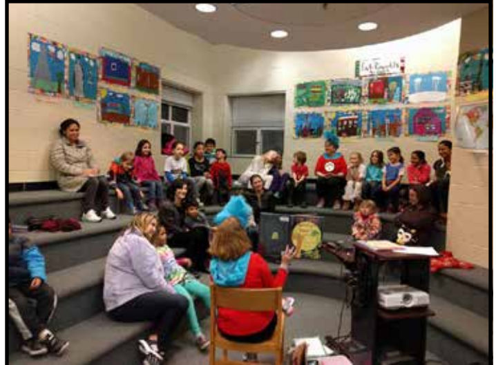
Students and parents alike enjoyed storytelling at Barcroft's book exchange

Upcoming events include Barcroft Information Sessions for new families on March 14 th at 12:45 pm and April 6 th at 9:15 am. This is an opportunity to learn more about our school, including the modified calendar, FLES, Science Lab, School Wide Morning Meetings and PTA. And the Barcroft 2nd Annual 5K Snowball Stride on March 11 th at 9 am. Runners and walkers welcome! Register at https://BarcroftSnowballStride5K.itsyourrace.com/register/