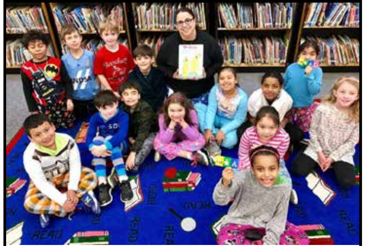
Read Across America reaches all the way to Barrett Elementary! Happy Birthday Dr. Seuss!

We are competing in WTOP's Click for Kids Sweepstakes with a chance to win big money for our school! Voting runs from 3/6-3/17. Everyone (friends, families, neighbors) can vote once a day, every day, at http://wtop.com/contests/2017-click-for-kids-voting/ for money to the school. Top schools win prizes of 5, 10 or even 15,000 dollars!