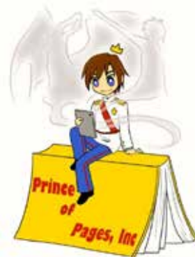
Prince of Pages, Inc.