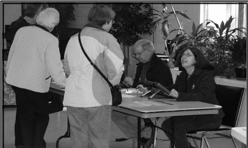
ELECTION DAY: Pictured below, Arlington Forest voters turned out on Nov. 2 for U.S. Congressional and local elections. Preliminary results show that 1064 of 2186 registered voters cast ballots at our Precinct 025 at Culpepper Gardens. That 48.7 percent turnout compares to the county-wide average of 43.2 percent.