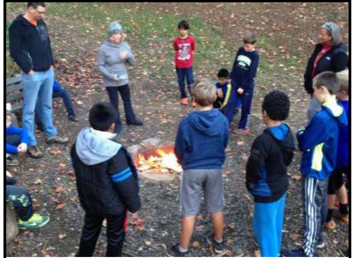
The 5th Grade boys stay warm beside the fire pit at the Outdoor Lab. Barrett sends the 5th graders in two groups, boys and girls, in the early weeks of November.

Next up? After a long weekend marking Veterans Day, Barrett will steam toward the holiday season with the start of Barrett Gives. If possible, families are encouraged to help the members of our community who are struggling. The PTA organizes a comprehensive program to match families with those in need.