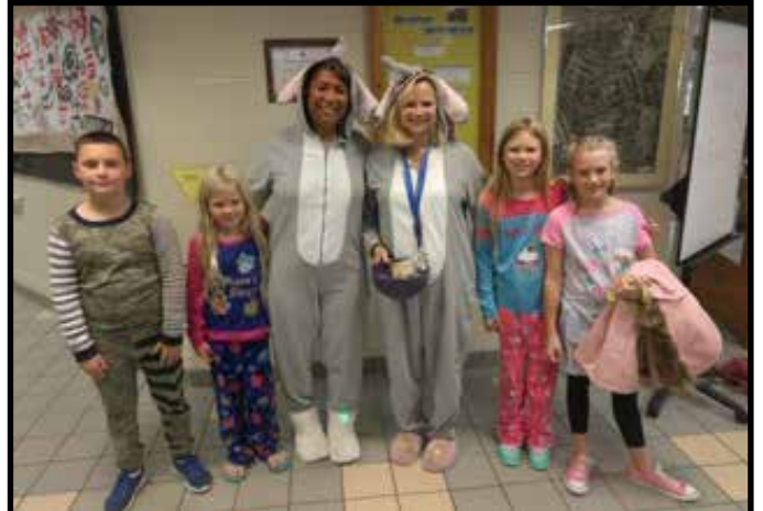
Students and staff enjoyed Pajama Day on Oct 28.